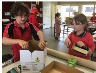
Students from the Year 4/5 class busy with castle making to meet a Design Technology brief.