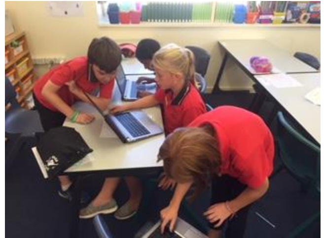
Students from the school's TAGS Challenge and Extension program collaborate and problem solve