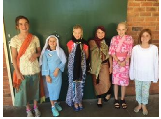
Students from Year 5/6 enjoying explorations of Asian cultures in the lead-up to Harmony Day